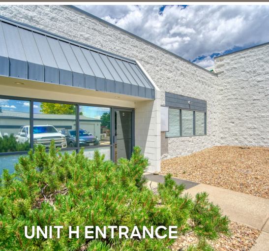
UNIT H ENTRANCE