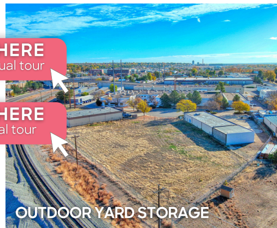
OUTDOOR YARD STORAGE