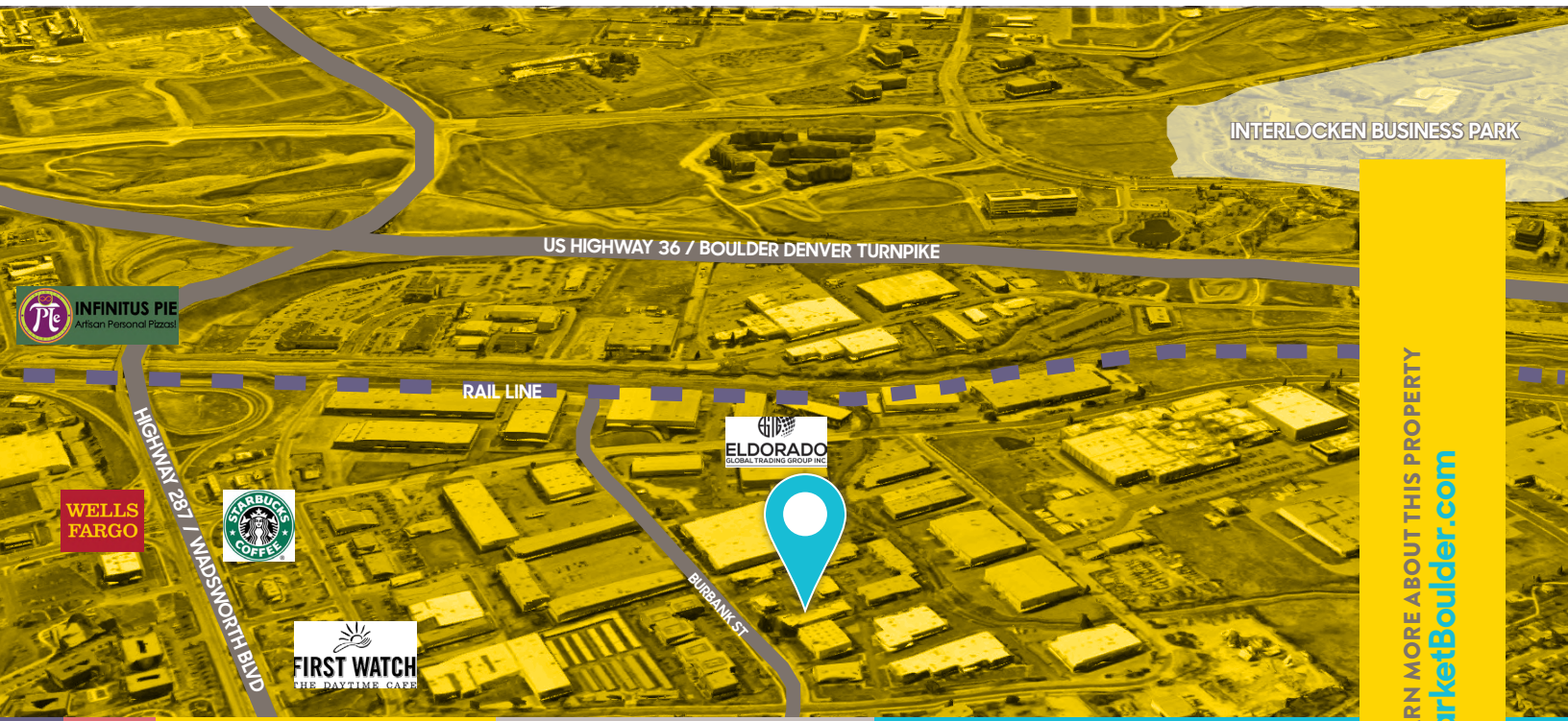
555 Unit J

LEARN MORE ABOUT THIS PROPERTY MarketBoulder.com